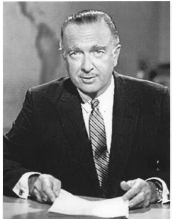
In other news... Monday Night Bingo Starts at The Phoenix Club. There were no casualties.

This is a day that we use as a fund raiser for our club and we would like as many members to come as possible. That is why we ask this to be an adults only event and as far as I know the only day of the year we ask that children do not come to the club. We have MANY family oriented functions throughout the year for you to bring children and have fun. The Annual Family Picnic, All of our themed Family Pizza Nights, Breakfast with the Easter Bunny. Breakfast with the Scarecrow in the Fall, The yearly Children's Christmas Party. Our Turkey and meat raffle with also have a variety of non meat prizes to be won as well so please plan on spending the day at the club.